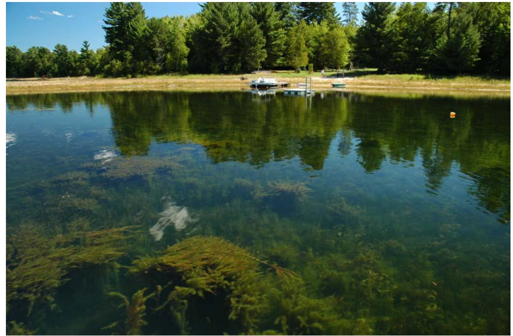
FIGURE 3. Eurasian watermilfoil in Sand Bar Lake.