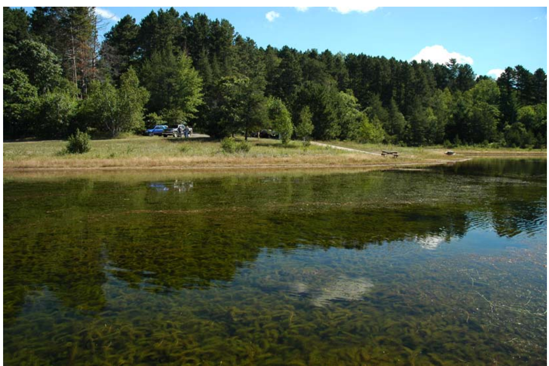
FIGURE 2. Eurasian watermilfoil in Tomawhawk Lake, facing boat landing and Town Park.

The lakes are separated by a narrow sandbar in low-water years, but in the past the sandbar has been inundated to form one surface water system. Tomahawk Lake has an improved public access at the Town Park (Figure 3), which also includes skiing/hiking trails, a swimming beach, and picnic facilities. Sand Bar Lake (Figure 4) is accessed by pulling watercraft over the sandbar from Tomahawk Lake.